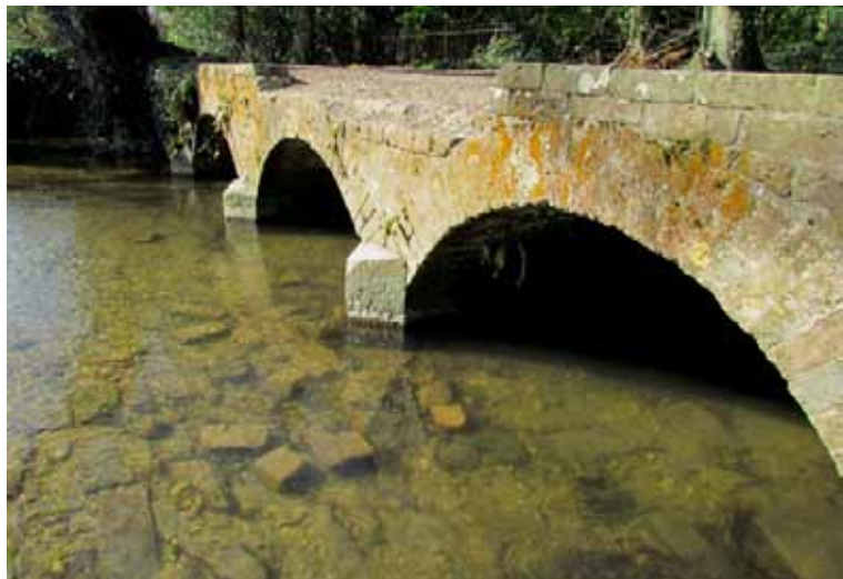
Bridge over the River Frome

Hardy's Wessex was based on the places he grew up in and his writings captured a time when Britain's countryside was at the point of rapid change.